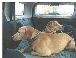
Landon and Louie