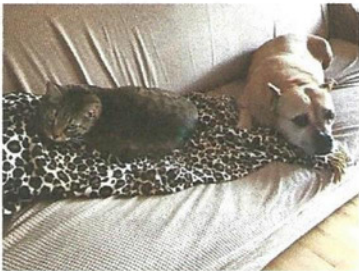
Baby and friend