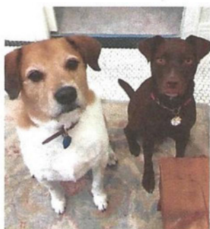
Max and Coco