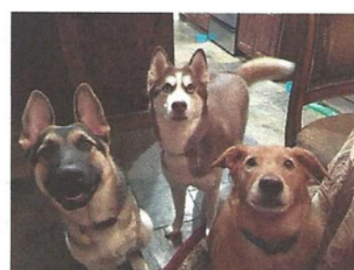
Champ and two brothers

Sonja's mom adopted her last spring after waiting until she was old enough to be spayed. She shared a pic of beautiful grown-up Sonja in February. Einstein is now Champ and his family shared a new picture recently.