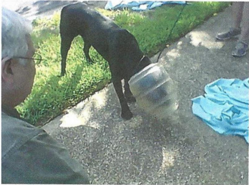
People can be so cruel