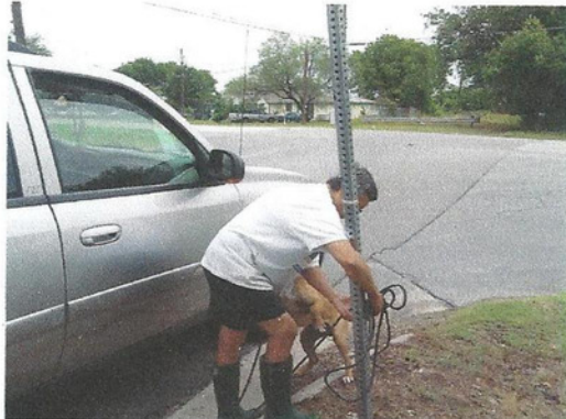
Brown dog tied to stop sign