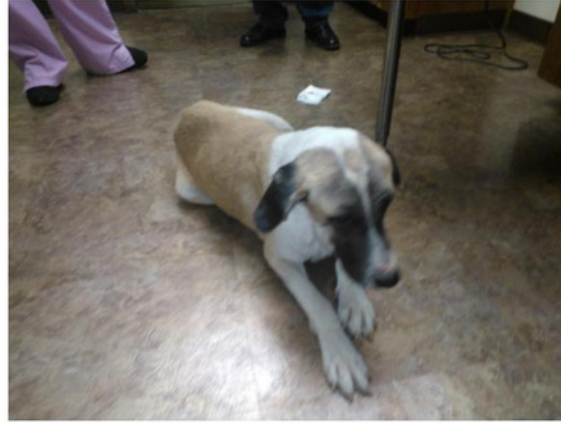
Milo says, "Where are you taking me?" and at the vet.