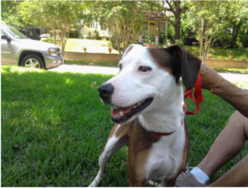
Geno (now named Buddy)

Geno was adopted by a nice young couple in June. They wanted a playmate for their dachshund. Peaches and Walter were taken to adoption day on July 7 and a family took a liking to Walter. On July 15 Walter went to live with his new family in Rockwall. It appears that Walter has issues with men and has not been very friendly to the dad. They are continuing to work with Walter and love him. What a wonderful family to persist in their desire to keep Walter!