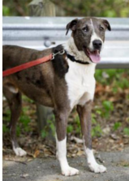
Look at all of the room Walter and his new friend have to play in!