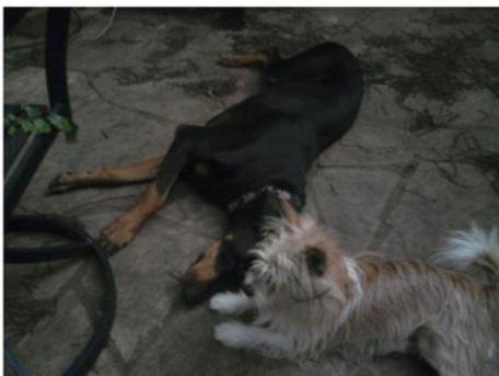
Opie and Suzi enjoying some play time.