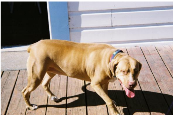
She's really not mean!