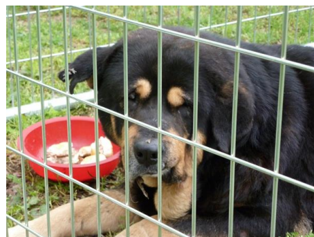
Sweet Zeus captured